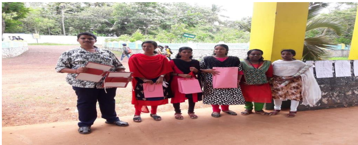
ASAP students with the paper bag and paper files made.....