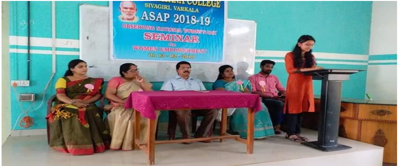
Women Empowerment seminar inauguration.....