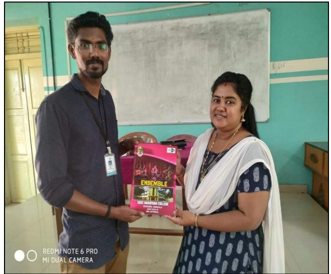
Magazine handing over to SDE