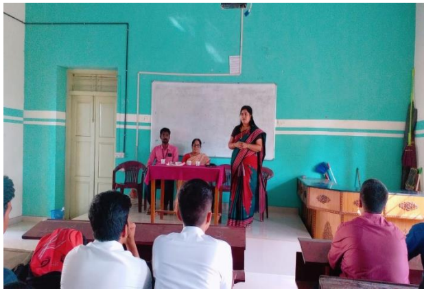
Batch starting day.....

previous batch in A.S.A.P by stressing on the skills and confidence acquired by the former ASAP students of the college. The programme ended with a vote of thanks. The sessions went effectively from the day and after each ten classes a feedback was collected from the students to evaluate the effectiveness of the sessions. Students were very curious and enthusiastic throughout the sessions as it was a first time experience for them.