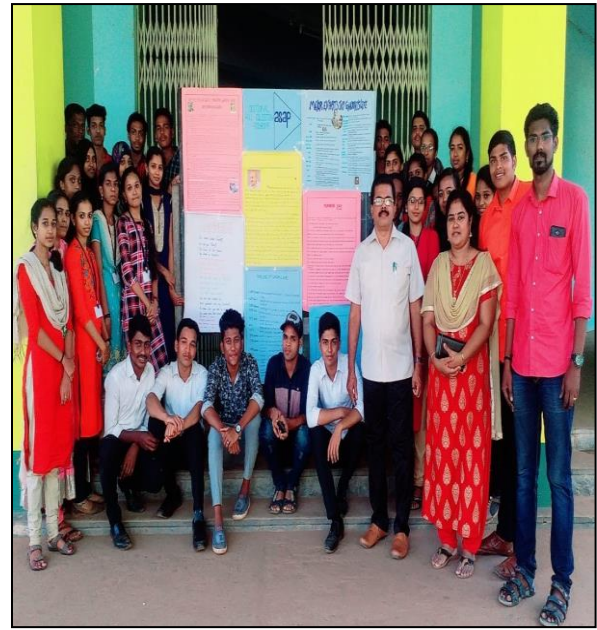
Wall magazine by asapians.....