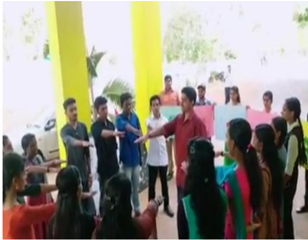
World water day oath.....

college to learn more about water-related issues and to take action to make a difference. Our members give awareness to the other students about the importance of maintaining water resources neat and clean and also to consume it wisely. Asapianz took an oath to protect water resources.