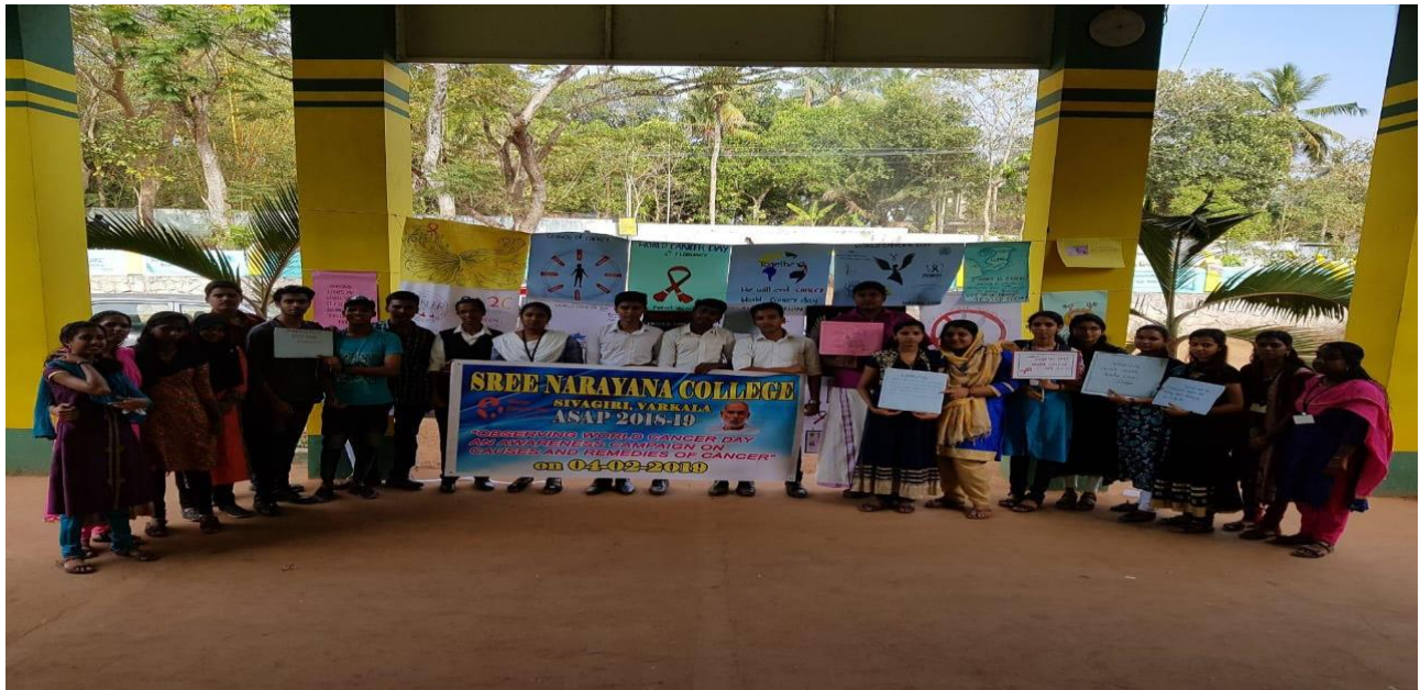
Asapians after cancer awareness campaign in classes and poster exhibition.....