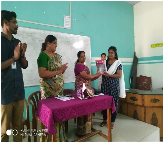
Magazine releasing by Principal

moment of joy when the principal congratulated the whole ASAP team for the efforts they put it in the making of the magazine.