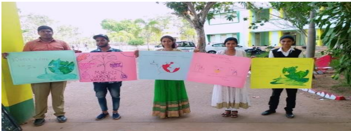
Save Water Awareness Campaign.....

After the successful completion of 180 hours of foundation module and skill module students underwent APTIS test and the respective skill test in the Attingal S.D.C.