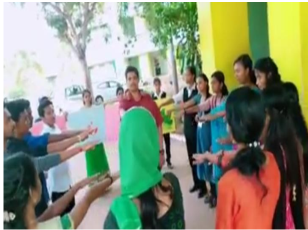
World Water Day oath.....