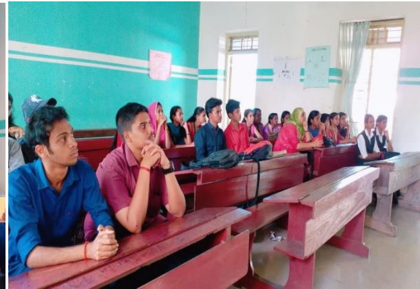
New batch students .....

Our batch included 30 students who completed the ASAP 180 hour course (foundation module and I.T) and skill course. After the completion of foundation module the students attended APTIS test and successfully passed it.