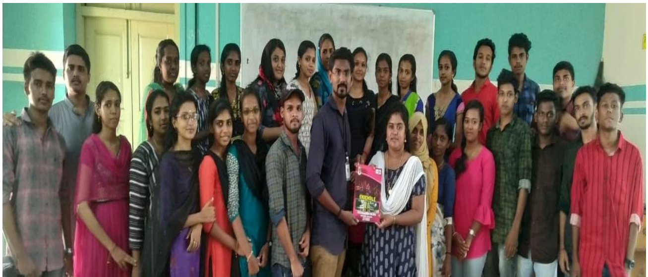
Asapians with their magazine .....