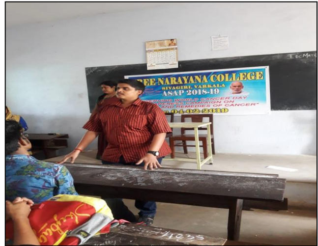
Awareness programme by asapians